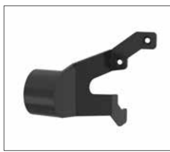
Handrail - End