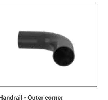
Handrail - Outer corner RAL 9011