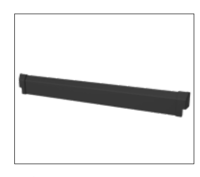
Kick Plate A kick plate is always included and available in length 1000 mm and 1500 mm.