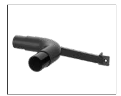
Handrail - Inner corner With support arm, RAL 9011