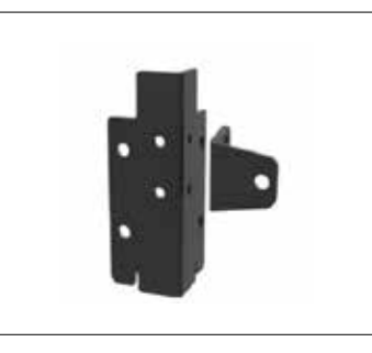
Kick Plate - Bracket Inner corner