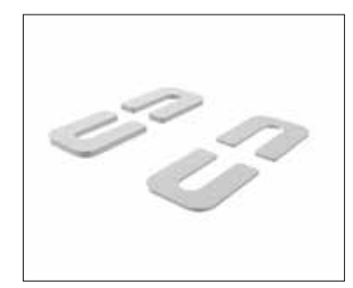
Shimset Used to adjust the height of X-Rail posts where the floor is uneven.