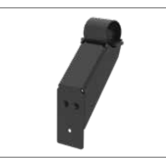
Handrail - Fitting With rivet, 1 KIT