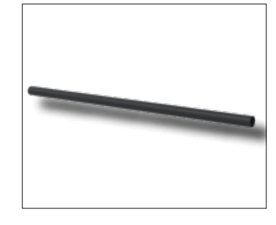
Hand- and kneerail Available in length to fit panels with the width 1000 mm and 1500 mm.