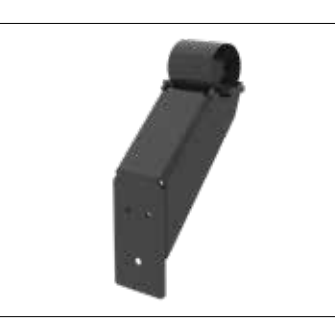
Handrail - Fitting With selfdrilling screw, 1 KIT