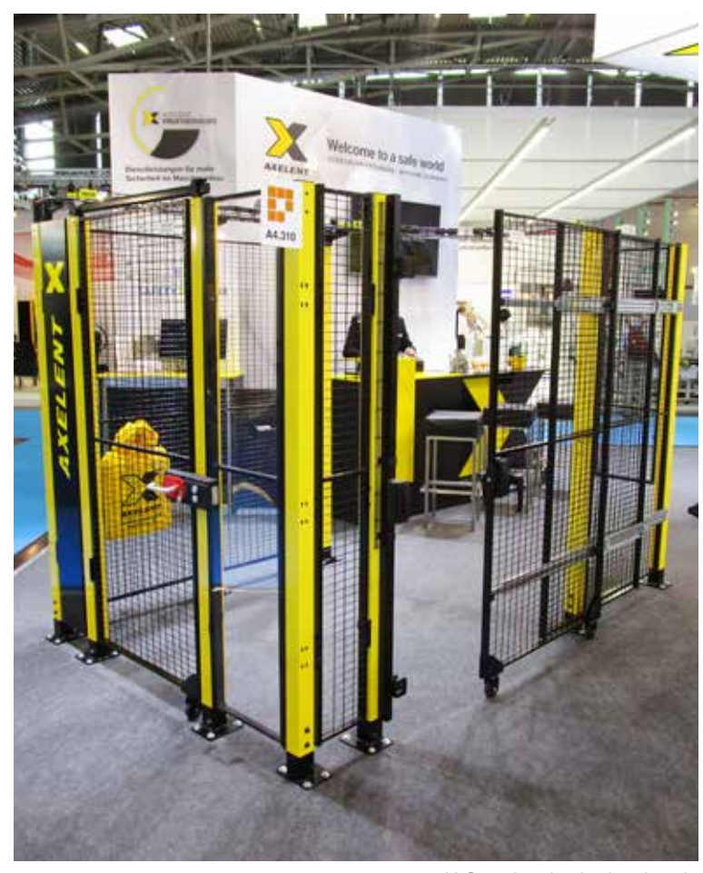
X-Guard at the Axelent booth.